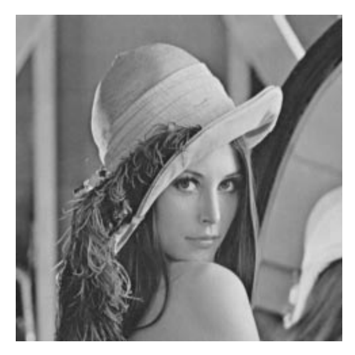
Fig. 2. A watermarked image of Lena

Figure 2 shows an image that was quite strongly watermarked using the techniques described in this paper. Figure 3 shows this image after JPEG compression was applied at 15% quality factor where it is found that that the storage required is less than 1% of that needed for the original image. Not surprisingly, the quality is very low and the image is of little commercial use. A 104 bit watermark "The watermark" (in ASCII code) can be recovered from the JPEG compressed image.