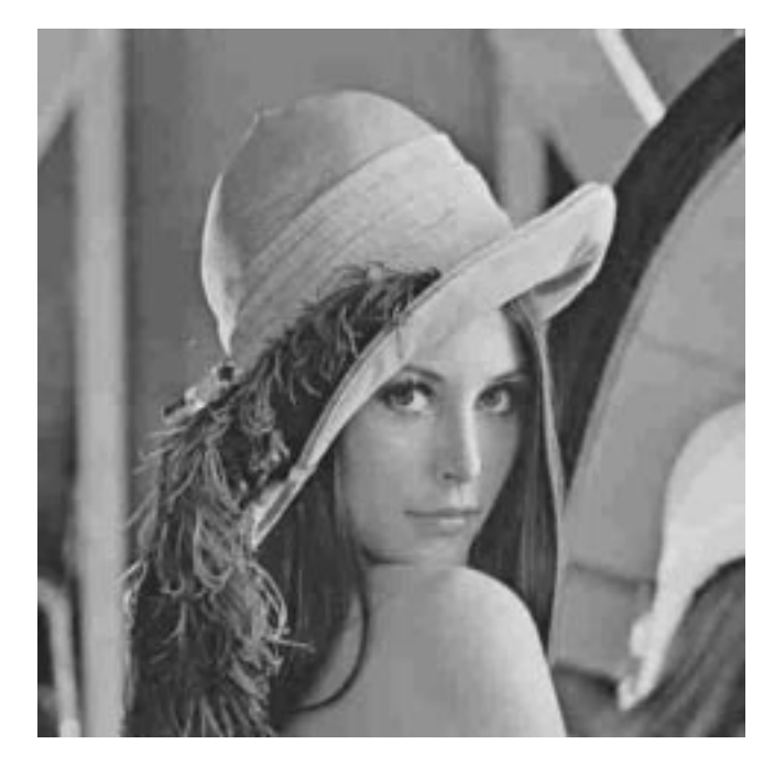
Fig. 3. A watermarked image of Lena compressed at 15% quality factor. The compression ratio is 100:1

Robustness to other attacks: Specialised watermark removal algorithms have been proposed in the literature. StirMark [Kuhn97] uses both contrast based attacks and geometric attacks. The geometric attacks are not directly addressed using the method proposed in this paper. However, we can give one good example of the robustness of the spread spectrum watermark described in this paper to a contrast based attack. The results are as follows: