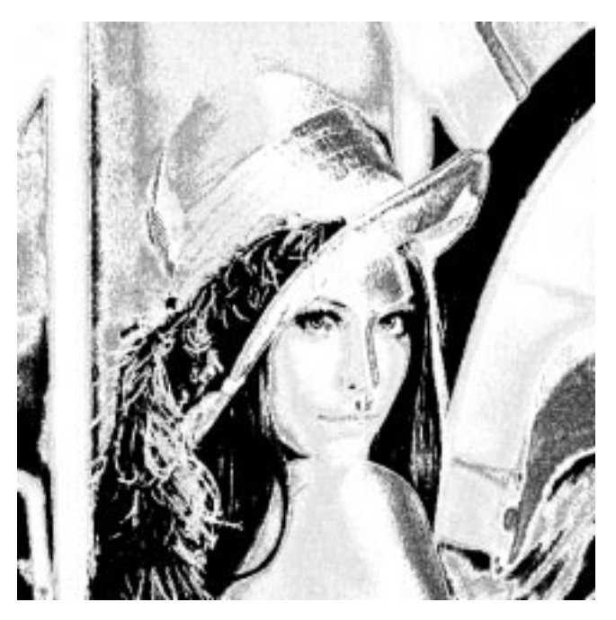
Fig. 4. The watermarked image of Lena after being attacked using "StirMark"

important. There is a good case for arguing that the template is somewhat more robust than the watermark. The reason for this is, that the template actually has to carry less information than the watermark. For example, suppose it is only possible to recover the watermark if the rotation angle and scaling factor recovered using the template are both 99.9% accurate. To give 99.9% accuracy one needs \log_2 (1000) \approx 9 bit. Specifying both the angle and the scaling factor therefore needs around 18 bit which is considerably less than the amount of information contained in a typical watermark (about 128 bit).